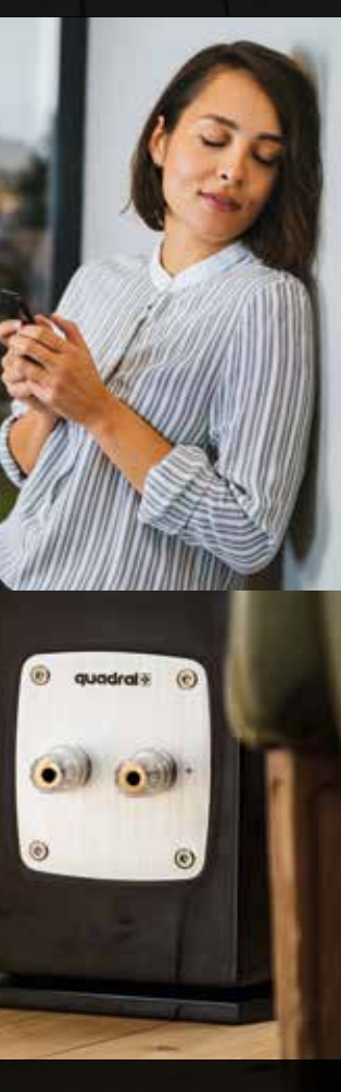
Curved cabinet lines with a noble high gloss varnish