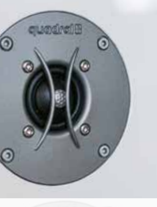
Super Audio Tweeter protected by a solid bracket