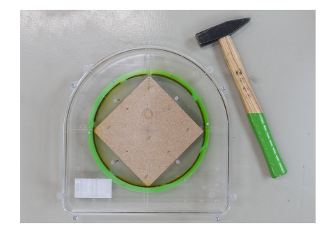
2. Position the lower part of the speaker back box and fix in place with 4 nails. (Take care when fixing in place and only hammer in nails until they are flush with the top of the back box.)