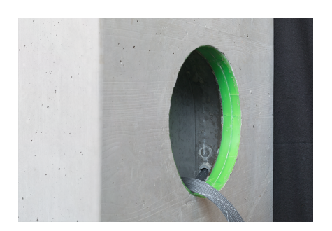
5. After concrete has set and the cast has been removed::