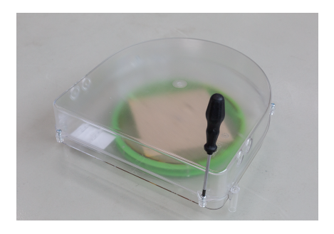
3. Attach the upper part of the back box using 4 screws.