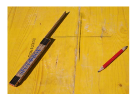
1. Determine desired location in the ceiling and mark position on cast.